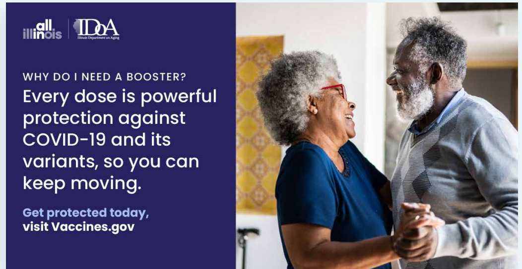
Social Graphic 3