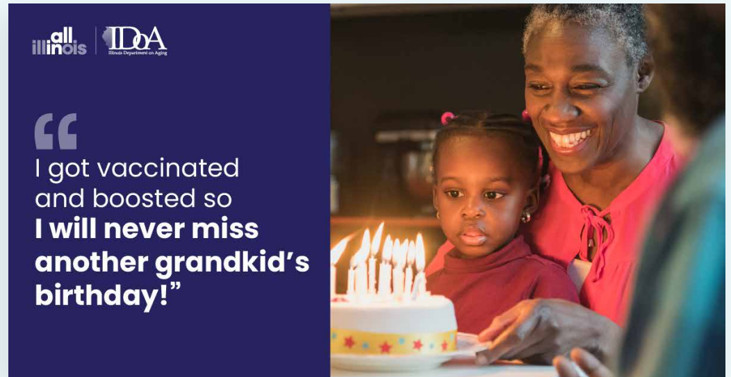
Social Graphic 5