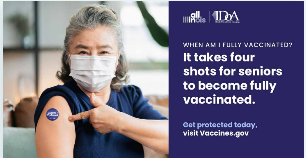
Social Graphic 2