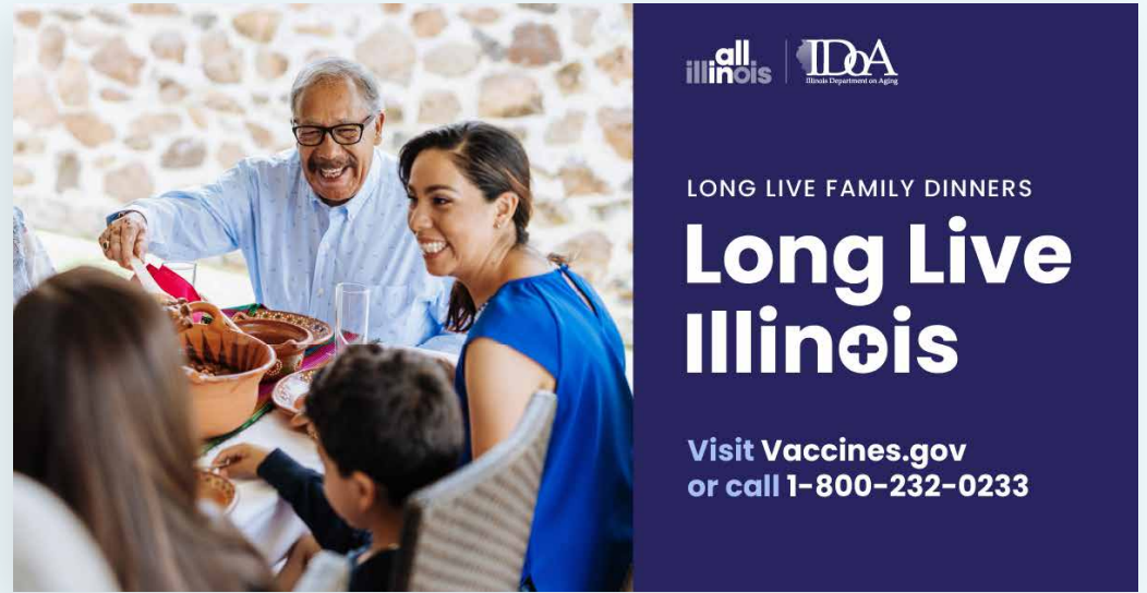
Social Graphic 1A