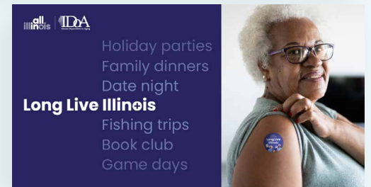
Social Graphic 1C