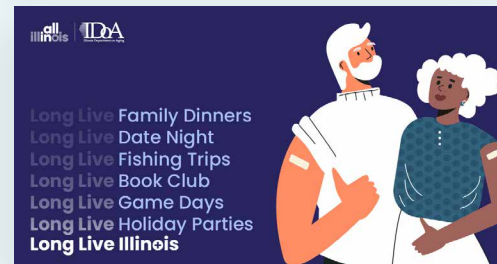
Social Graphic 1B