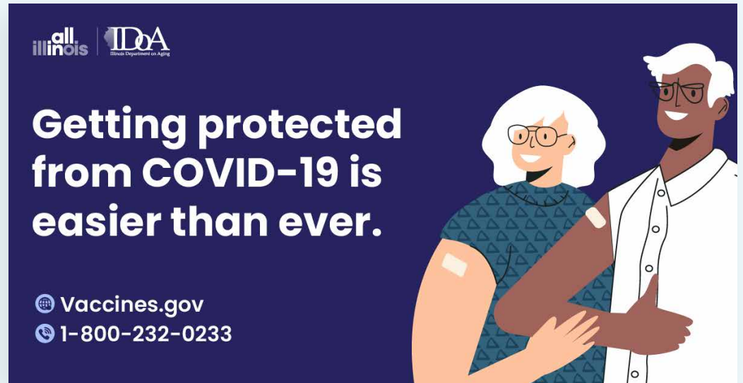
Social Graphic 4