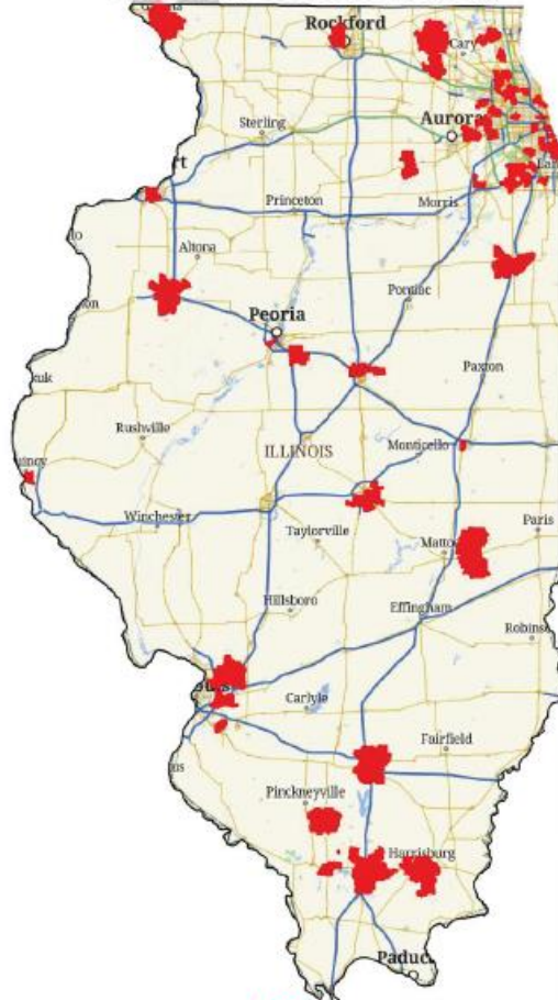
The Number of Communities without an Adult Day Center is Growing

Highlighted in RED , are the remaining Communities with an Adult Day Center