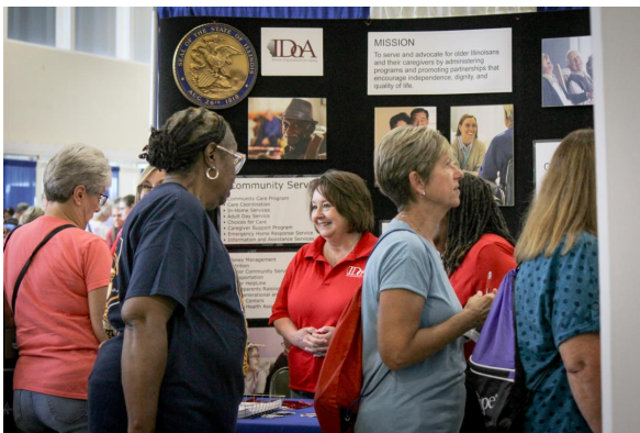
State and community partners distributed freebies and information to thousands of older adults who visited the Illinois Building.