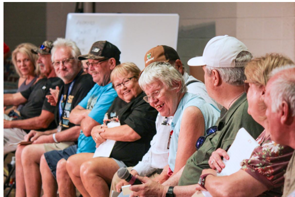
Longtime couples competed in the Not So Newlywed Game, testing how well they know each other after decades of marriage.

Scammers Targeting Digital Wallets to Steal Your Money Are on the Rise