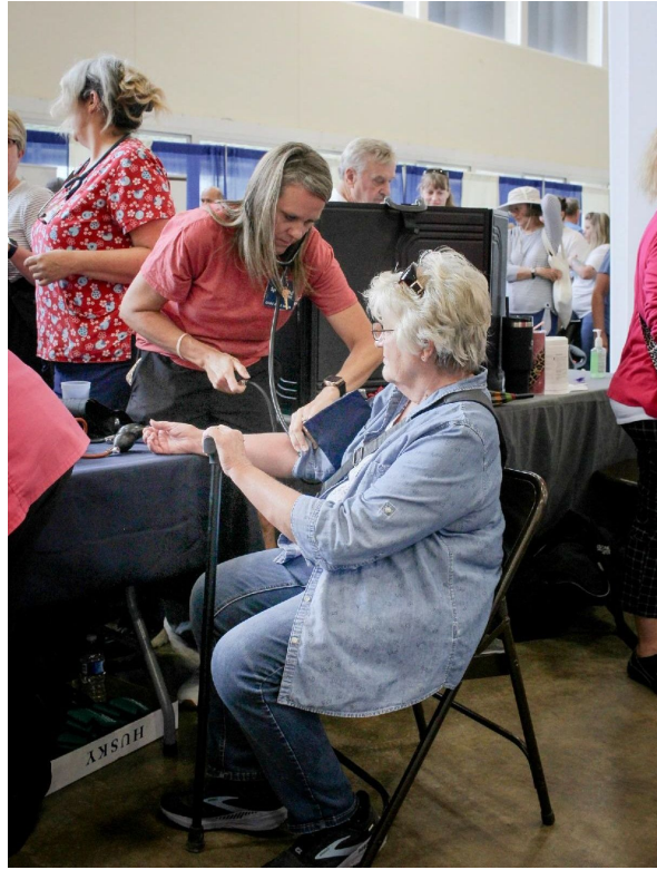
More than a dozen healthcare providers offered blood pressure, blood sugar, and kidney screenings, hearing assessments, falls prevention tips, and health and wellness resources to older fairgoers.